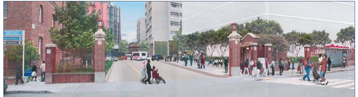
Rendering from planning documents